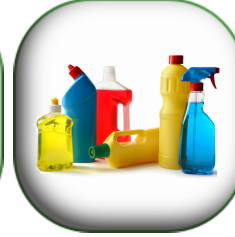
Cleaning Supplies, Polishes, Polish Removers