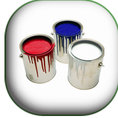
Oil-based paints, Varnish, Thinners