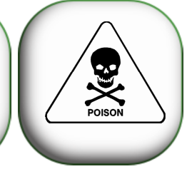
Toxic Chemicals, Poisons

Acetone Aerosol cans, full Antifreeze* Batteries Battery acid Brake fluid Car batteries Car wax Contact cement Driveway sealer Dry cleaning solvent Fertilizer Fiberglass epoxy