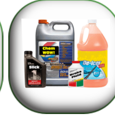
Automotive Chemicals, Oils, Cleaners