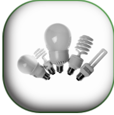
Fluorescent Lighting, Mercury Products