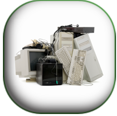
Electronics* *$10 fee for monitors & T.V.s