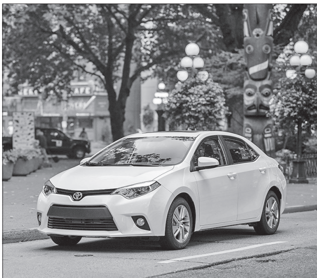
AUTO DIGEST Marketplace

The S model has a different front end treatment than the other models. The grille area of most models is trapezoidal-shaped, while the one on the S model is a reverse, or upside down, trapezoidal shape. The S grille also has a gloss